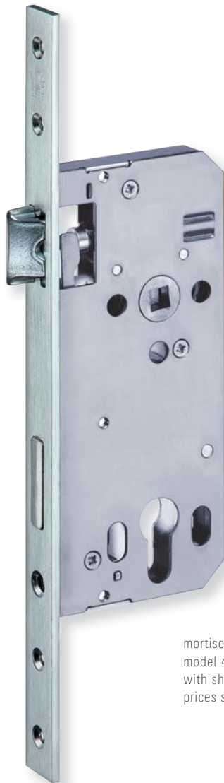
mortise lock model 451/451F with shift latch prices see page 390

On the outside these locks are not noticeably different from other mortise locks for inside doors. However as is often the case, the inner qualities are what really matter. And this lock has a lot to offer: The lock 421E, for example, is equipped with a reinforced case, a solid steel bolt, integrated bend protection, and an additional latch. Consequently it has also been approved for ÖNORM EN 12209 protection class 4. All series are tested for door weights up to 200 kg and are therefore suited for public areas under heavy loading.